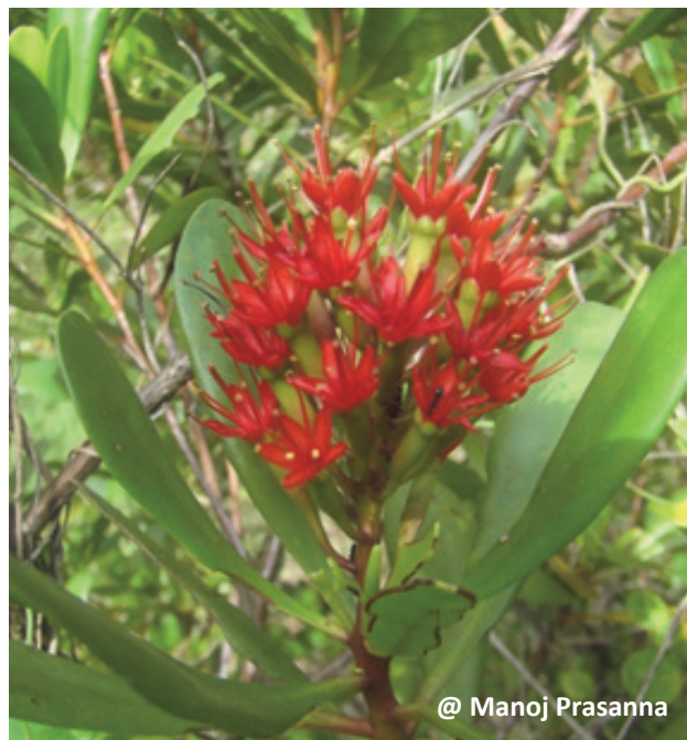
Flower of Lumnitzera littorea (Jack) Voigt